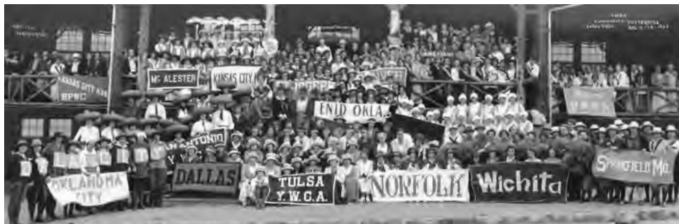
1923 YWCA community conference, YWCA Enid at the center of it all!

20,000 VISITED Y.W.C.A. ROOMS DURING YEAR Enid Association, Founded in 1920, Is Far-Reaching in Work 900 GIRLS, WOMEN AIDED IN EMPLOYMENT Y.W. Also Includes High School Girls Reserve in Program