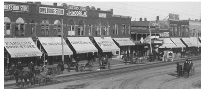
1920 YWCA Enid Location 120 1/2 West