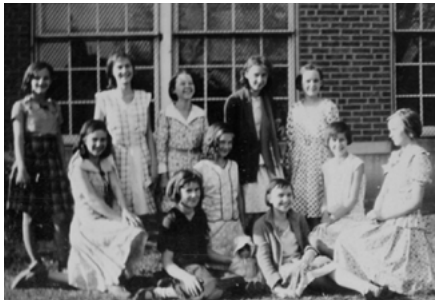
Junior High Girls Reserve Group