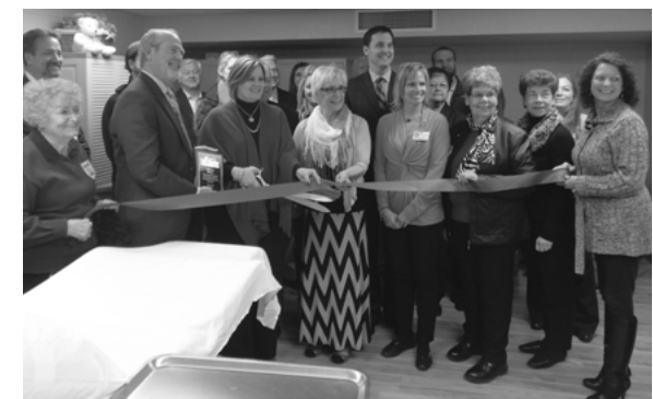
SANE room ribbon cutting