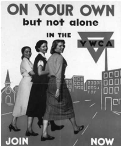
National YWCA Week April 20-26 1952