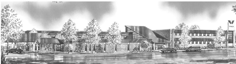
Architectural Rendering for YWCA Capital Campaign 2003.